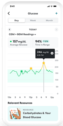
Trackable Glucose Readings